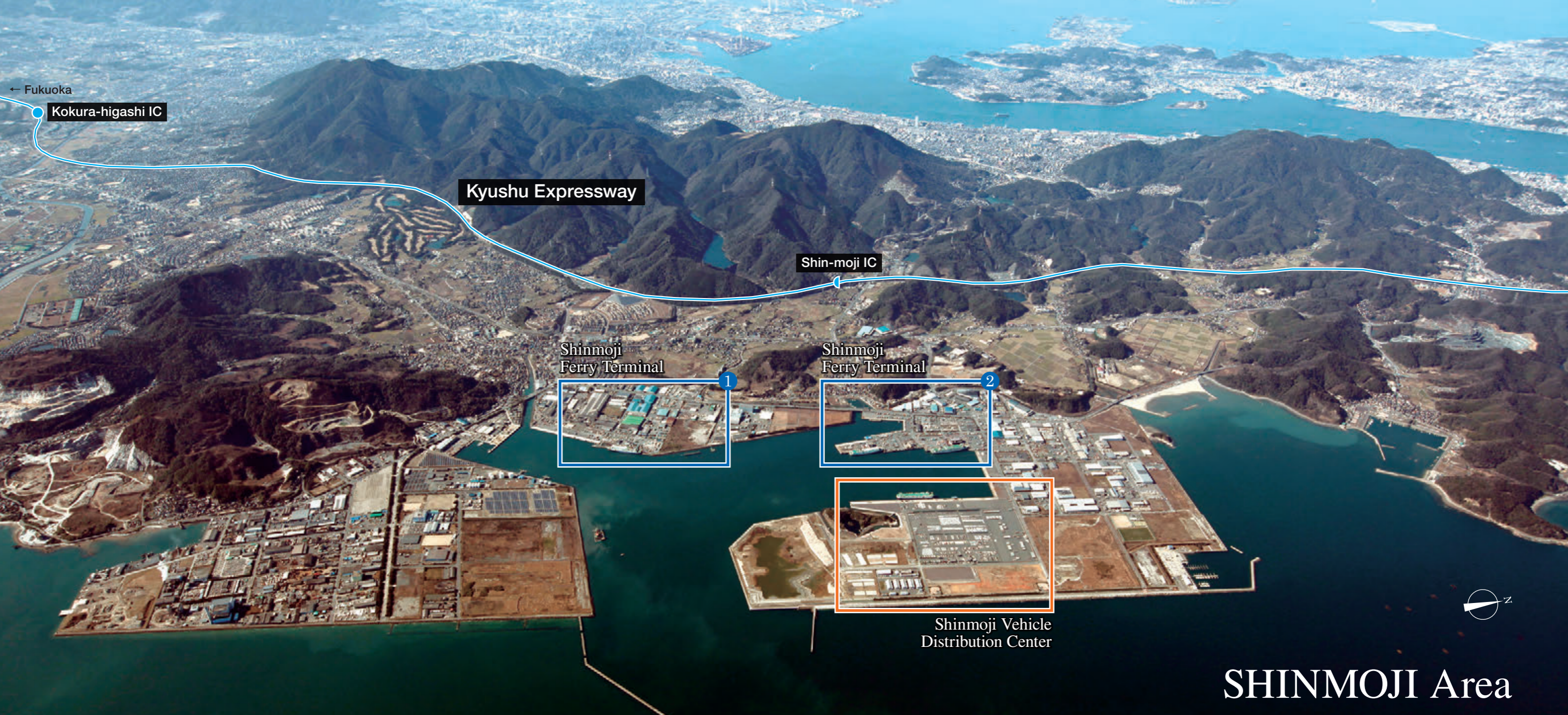
Shinmoji Ferry Terminal