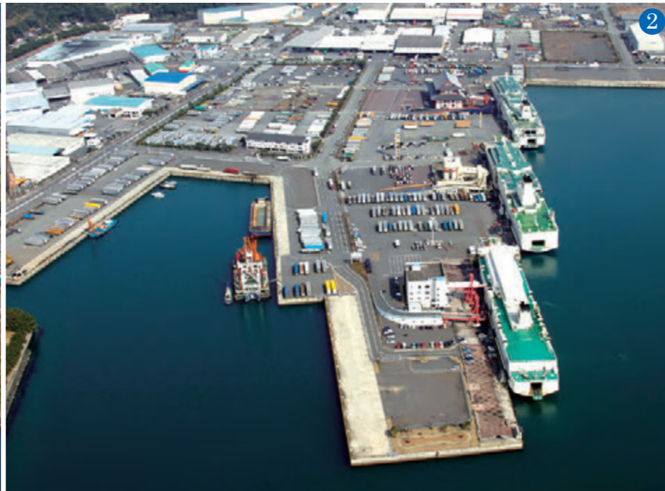
Shinmoji Vehicle Distribution Center